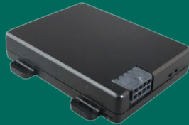
Certified Telematics Device

TeMeDa offers solutions for both AOB RD and ELD as your compliant solutions for HOS and eLogs. Our solution is made of three parts;